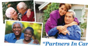
"Partners In Care"

SEATTLE, WASHINGTON 4135 Stone Way North - 98103 (206) 547-2200